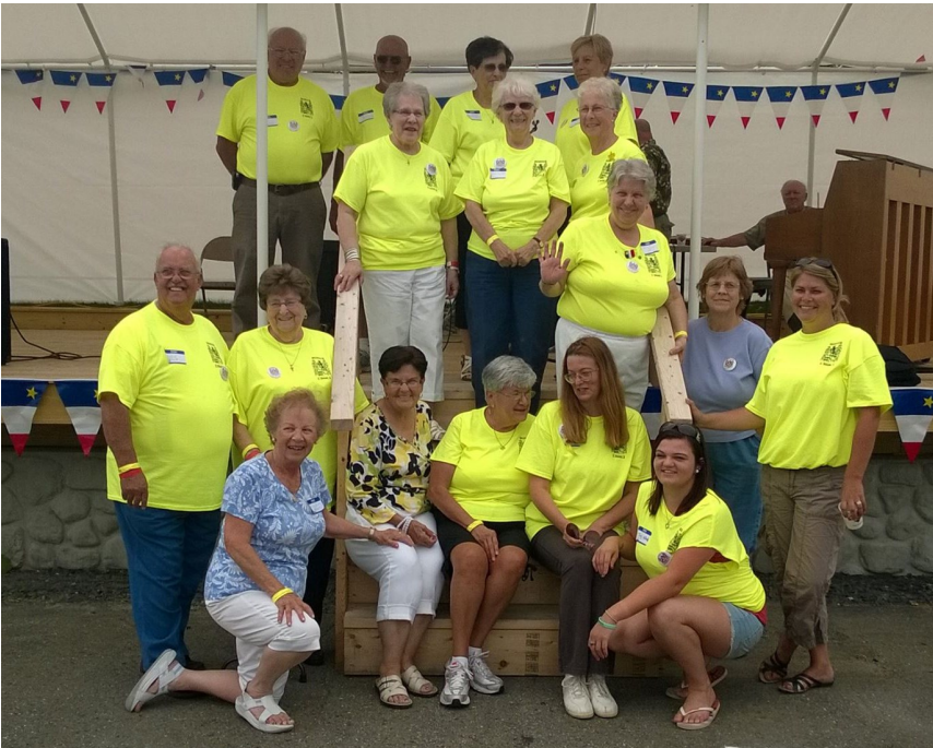
The Doucette Reunion Organizing Committee.